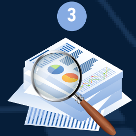
Root Cause Identified